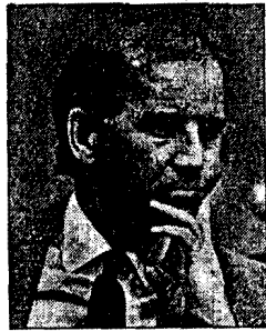
Sen. Joseph Biden Jr.

"Federal Court Watch" appears alternately in this space with "Superior Court Watch."